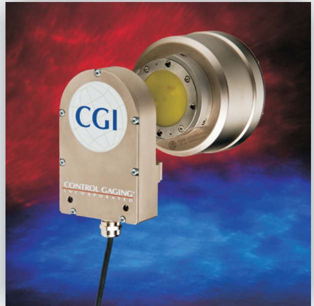
Balancing head with contactless transmission

The power and logic signals are transmitted through an air gap, allowing the FTC Balance Heads to operate at higher wheel speeds. These heads also have an exclusive zeroing cycle to neutralize the position of the weights. This is useful during machine startup or after a grinding wheel change.